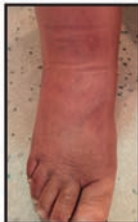
after 14 days

"Winning Souls for Christ, While Saving the Soles of Your Feet!"